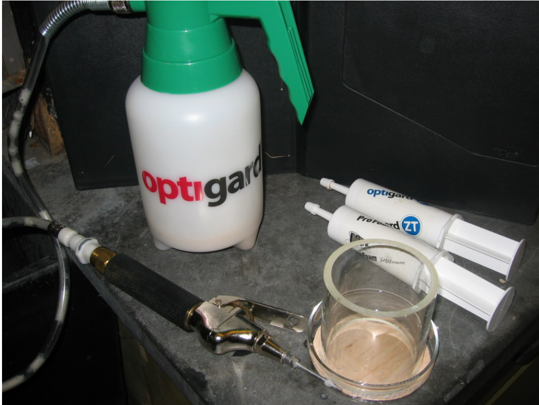
Fig. 1. The Optigard ® ZT Foamer Kit used to apply the Optigard foam to the balsawood surfaces.