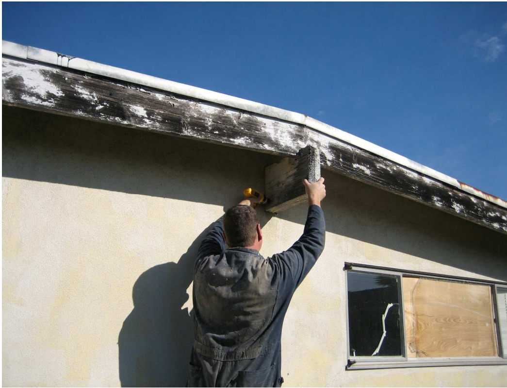
Figure 3. Example of drilling a board infested with drywood termites before Treatment; location Torrance, CA. Included in image is M. Red, Clark Pest Control.